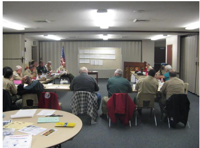
Our members at the planning meeting