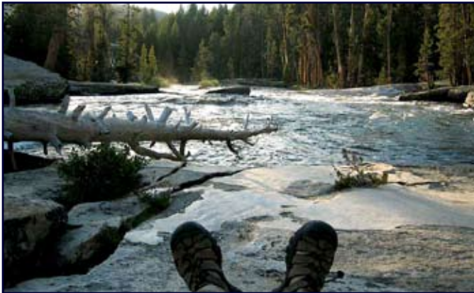
Headwaters of the Kings River, Western Sierra

Summer is here and it's time to get your unit into the great outdoors; on the trails and in the mountains. Here is a list of things that you need to be concerned about and that will help you to have a safe, fun and exciting summer High Adventure.