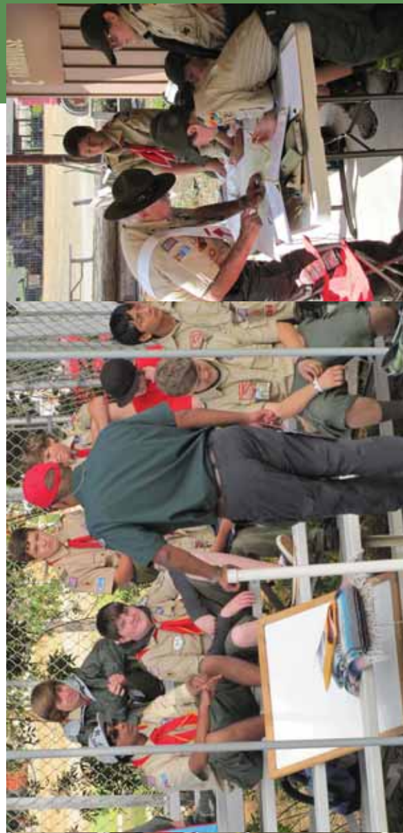
Santa Margarita District - 6