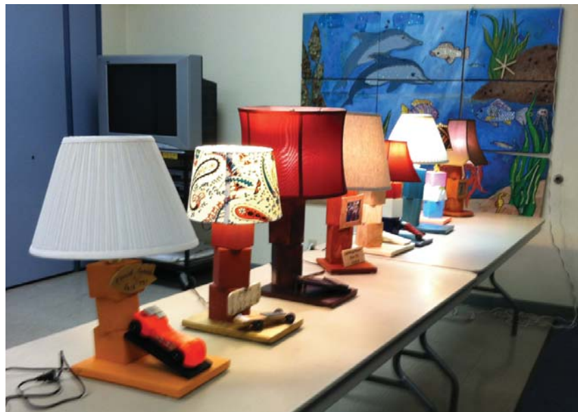
Lamps built by the Webelos IIs of Pack 751 are displayed at the Jan. 27 Pack Show and Arrow of Light ceremony.