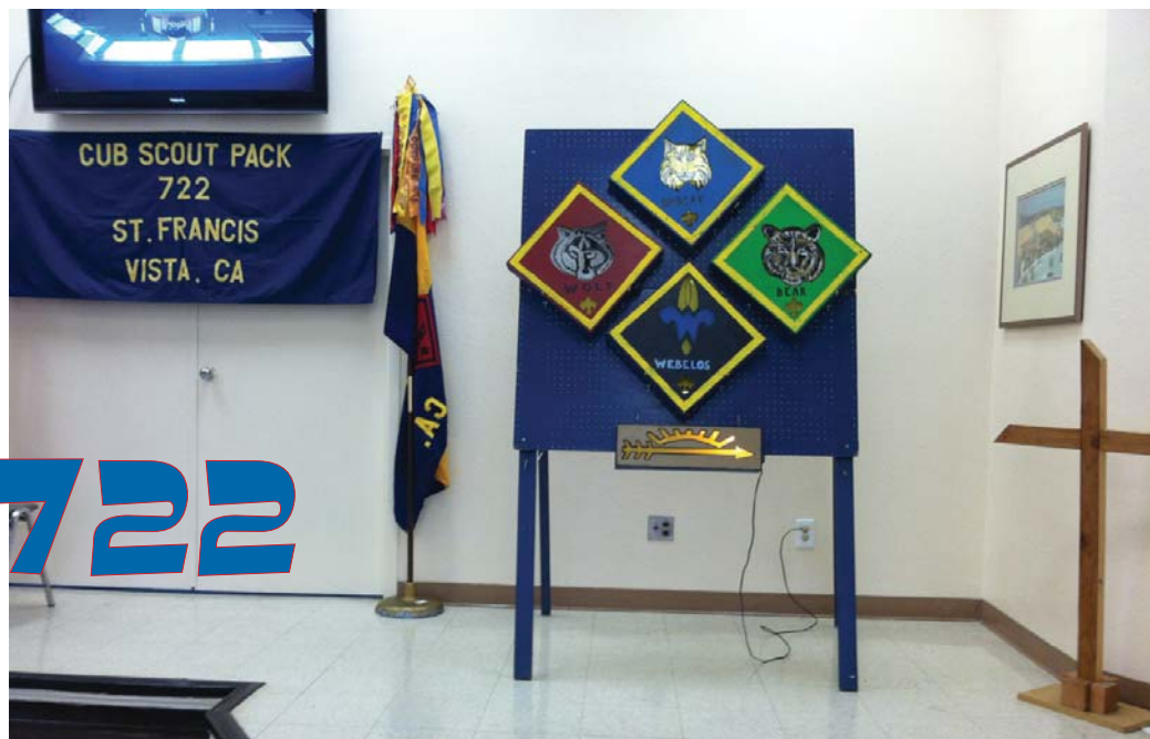
An Arrow of Light display at Pack 722's Blue and Gold banquet at St. Francis Parish in Vista on Feb. 8.