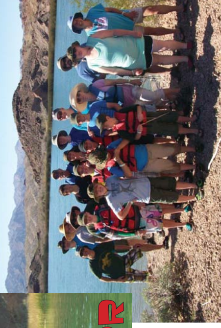
Over the President's Day break in February, Troop 799 canoed down the Colorado River.