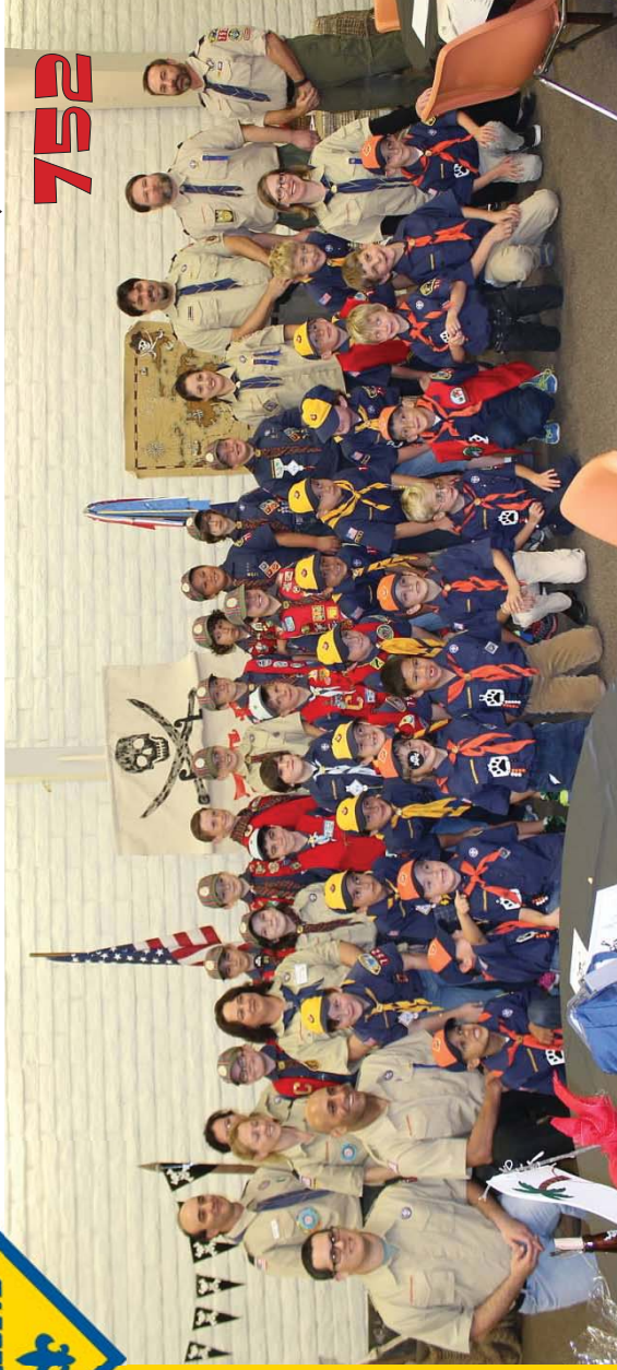
Pack 752 of Oceanside, celebrates their annual Blue and Gold Banquet on February 7, 2015 with a Pirate theme.