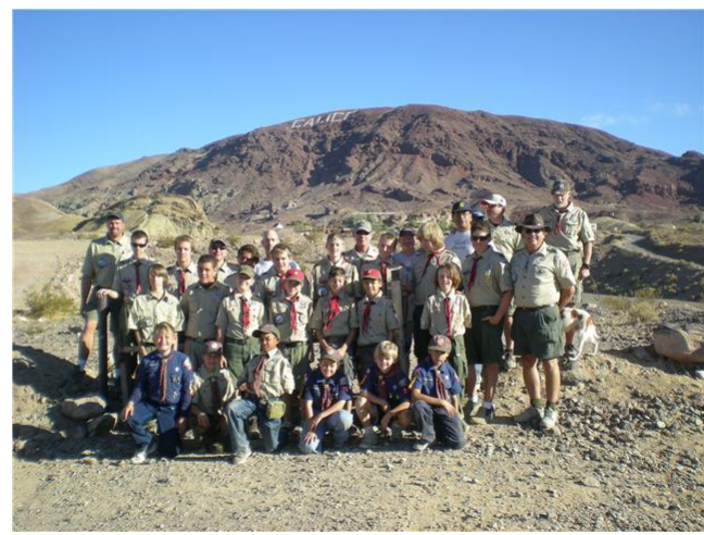
At the perfect time of the year, the weekend before Halloween, Troop 722 visited Calico Ghost Town for a couple nights stay where we met some ghosts and goblins.