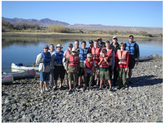
Our 60 mile canoeing trip down the Colorado River from Bullhead City to Lake Havasu.