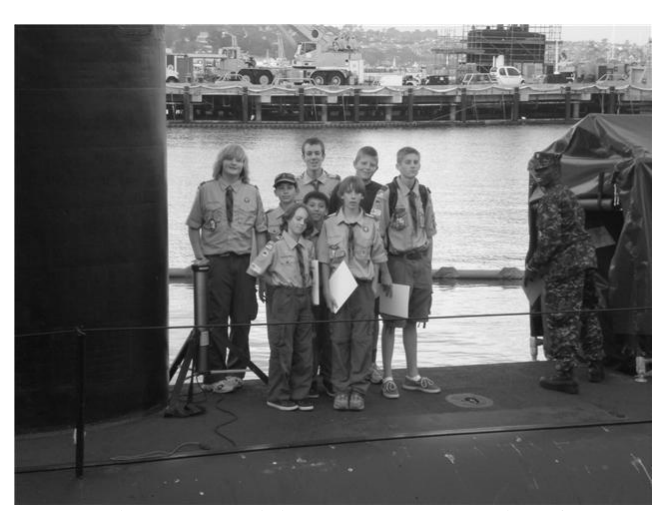
In December we toured the USS Hampton (submarine) on North Island Naval Base.