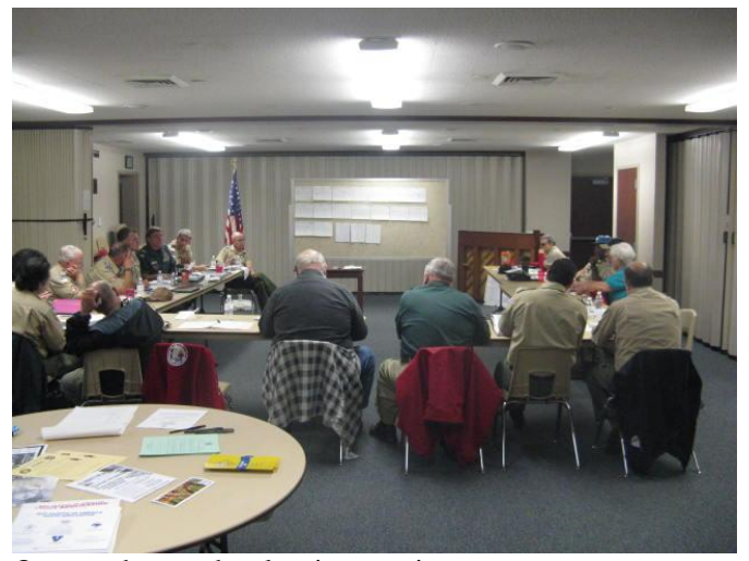
Our members at the planning meeting