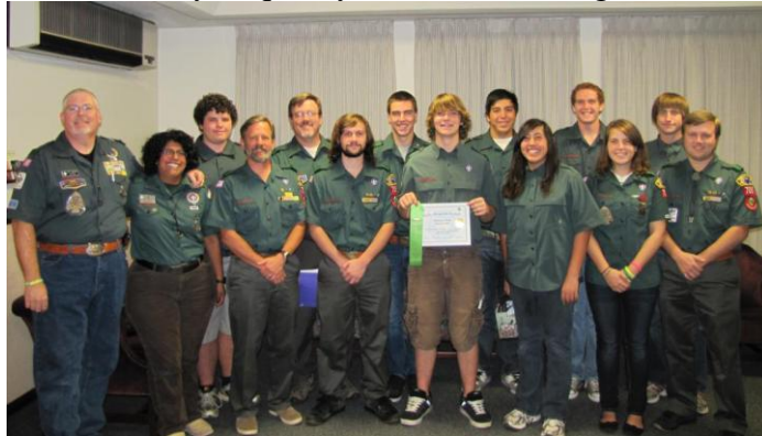
Congratulations Crew 709!

Looks like some units have been busy. We have had 3 units in our district pick up their San Margarita Honor Unit Awards. The requirements to earn this award can be found on our district website at: smscouting.org . Talk to your unit commissioner to see if you qualify! Come on- let's get 100% Honor units!