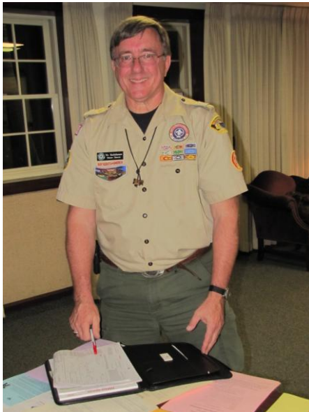
Do you have your Charter in?