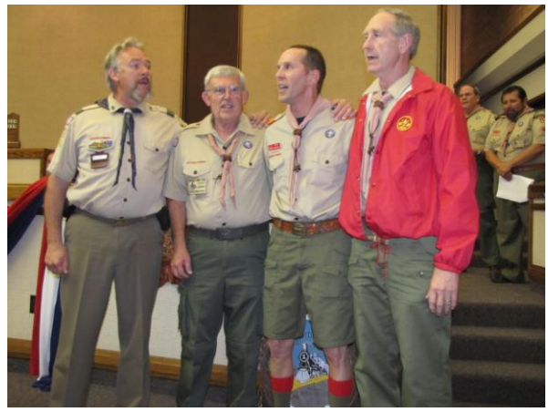
The Antelopes Singing