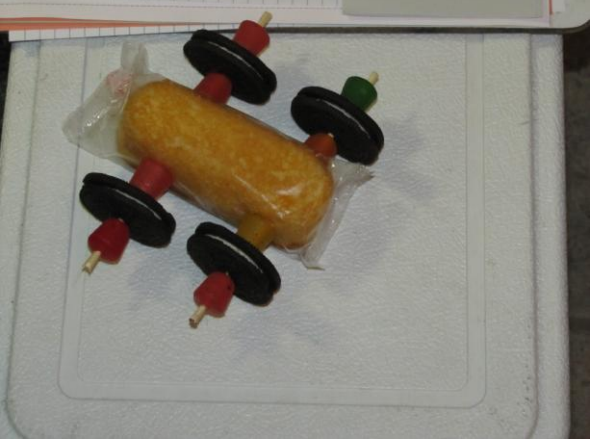
The newest most ingenious Pinewood Derby Car yet!