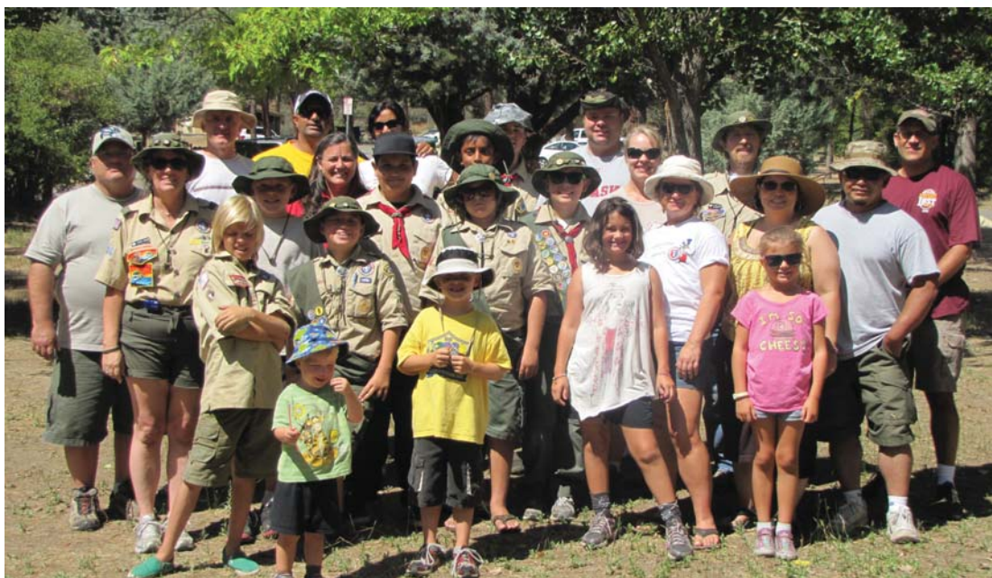
Troop 709 of Vista held Family Camp this August at Hurkey Creek.