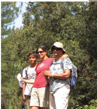
Elgonda Family on morning hike.